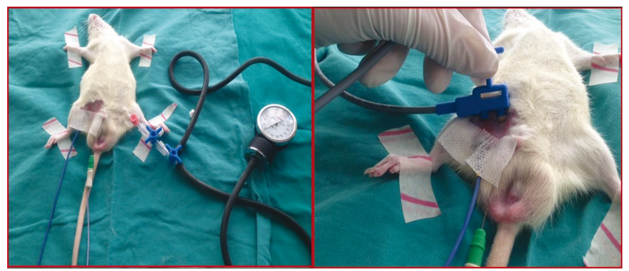
Figure 1. The experimental design: IAP increase (left), electrophysiological examination (right).

IAP exceeding normal limits causes dysfunction in several organs and systems (3). Increased IAP to maintain adequate space for laparoscopic procedures may cause neuropraxia in peripheral nerves and lead to postoperative pain in patients (4). Although the effect of IAH on the