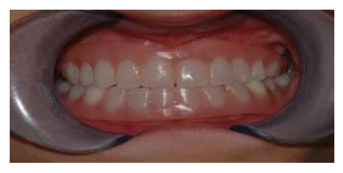
Figure 3. Frontal view of dentures