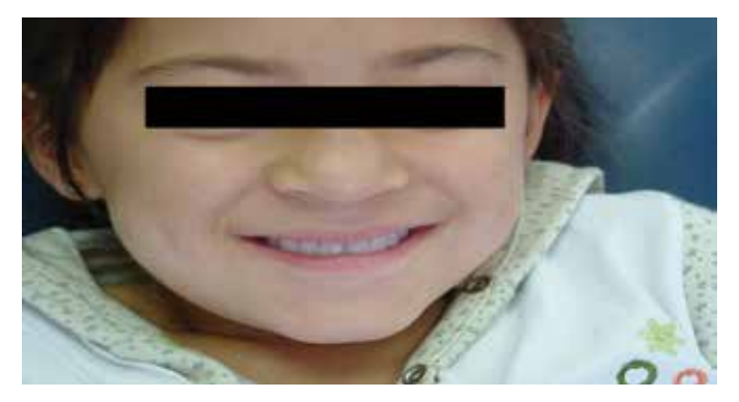
Figure 4. Satisfaction of the patient

Management of AI is a challenge for the patient and the clinician. Fixed prosthodontic treatment has been reported to be more conservative approach than other treatment alternatives (1). Several authors have