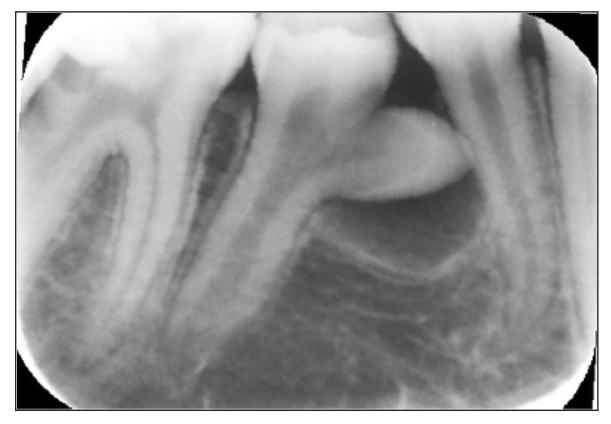
FIGURE 2: Double teeth in the right permanent mandibular second premolar.