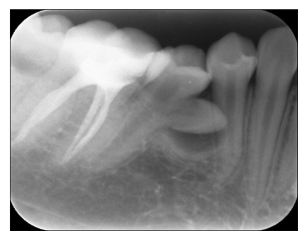
FIGURE 5: Periapical radiograph taken after 1 year follow-up.

Double teeth anomalies are generally asymptomatic. However, affected teeth may cause problems such as caries in the groove between