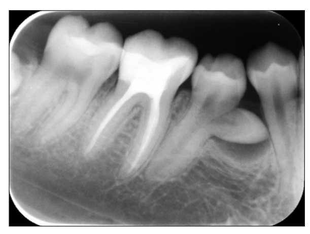
FIGURE 7: Periapical radiograph taken after 3 year follow-up.

conjoining parts, poor esthetics, and periodontal destruction. <sup>16</sup> In the case presented none of these complications were present, as the twinning part was underneath the gum tissue. Another concern to take into account would be the relationship between anomalies of the permanent and primary teeth. Double primary teeth may cause spacing or crowding problems leading to deficiency of facial profile or midline deviation in permanent dentition. The early detection of these anomalies is essential in terms of preventing such problems. <sup>5</sup>