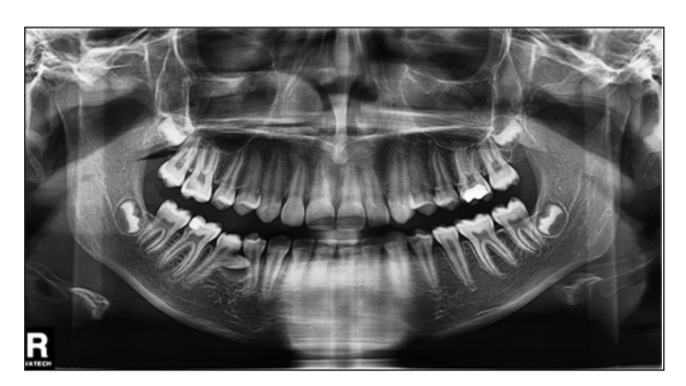
FIGURE 3: Panoramic radiograph.

ond premolar because the twinning part of the tooth remained stuck inside the gum tissue and had no clinically observable manifestation. Also, the patient had no functional, periodontal, or esthetic problems. Routine endodontic treatment was carried out with right permanent mandibular first molar. Oral hygiene instructions were provided.