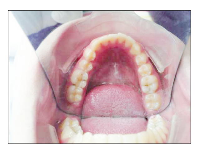
FIGURE 1: Clinical appereance showing all teeth in normal morphology and size.

During radiographic evaluation of the right permanent mandibular first molar, double teeth abnormality which was not clinically observable was detected at the right permanent mandibular second premolar. It had two separate crowns with a deep oblique groove and only one root (Figure 2). The tooth was asymptomatic; no periapical radiolucency was associated with this tooth and the lamina dura was intact. Panoramic radiographic evaluation showed no other dental anomalies (Figure 3). To ascertain the correlation of double teeth with anatomical structures, a cone beam computed tomography (CBCT) scan was taken. CBCT image showed no relationship between the crowns of the right permanent mandibular first and second premolars (Figures 4 a-c). No invasive treatment was planned to the right permanent mandibular sec-