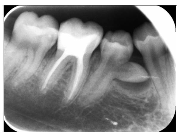
FIGURE 6: Periapical radiograph taken after 2 year follow-up