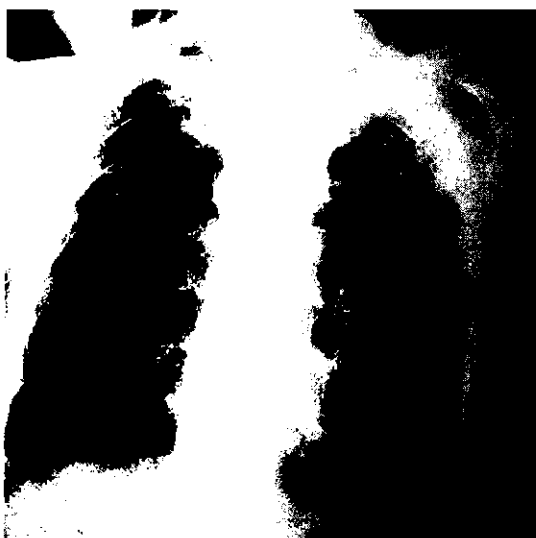
Fig. 1: Chest X-ray showing the bronchogram before the stent replacement.

A 64-year-old man was referred with a 4-month history of dysphagia. His history revealed that the dysphagia initially appeared with only solid food intake and with both liquid and solid food intake one month later. The patient had a persistent cough ten days prior to his admittance. The patient also had a history of 10-kg weight loss in the recent four months and treatment of pulmonary tuberculosis eight years previously. On physical examination, he had general weakness and mild dehydration. Laboratory data were within normal limits. His chest X-ray showed nonspecific fibrotic changes in the upper zone of the right lung. Upper gastrointestinal endoscopy revealed an ulcerovegetant infiltrating tumoral mass between 25 and 30 cm from the arcus of the upper teeth; however, we failed to pass the endoscope through the tumor, because the luminal opening was as narrow as 7 mm. We were able to pass a pediatric endoscope through the tumoral mass, which showed no abnormal findings in the distal esophagus or the stomach. Histologic examination of multiple biopsies from the tumor revealed a squamous cell carcinoma of the esophagus. His heavy and persistent cough alerted us to a possible diagnosis of esophagotracheal fistula. The patient began to cough following the intake of a diluted radiopaque solution (Iodine; Guerbet AS, Istanbul). His chest X-ray revealed the bronchogram showing the leak of radiopaque solution into the trachea (Fig. 1). The patient was