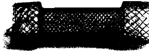
Fig. 2: Expanded appearance of covered metal stent.