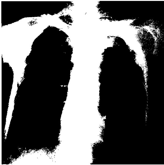
Fig. 4: Disappearance of the bronchogram image on the eighth day of the stent insertion.

(Fig. 4). The patient was discharged from the hospital 10 days after stent insertion and showed no symptoms of aspiration or dysphagia before his death from distant metastases and advanced disease sixteen months later.