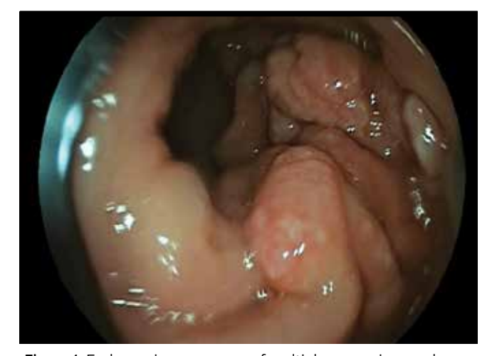
Figure 1. Endoscopic appearance of multiple pyogenic granulomas as polypoid rectal lesions

The widely accepted term of "lobular capillary hemangioma" emphasizes the essential component of the lesion.