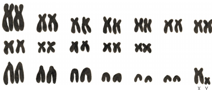
Figure 2. A male karyotype of Turkish Sus scrofa .

Our karyological data are in agreement with those of the domestic pig and wild boar in Holland, Poland and