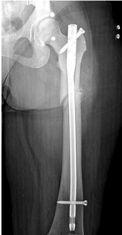
Figure 3. Postoperative anteroposterior x-ray of the left hip. The protruding proximal end of the nail is demonstrated.