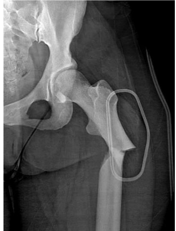
Figure 1. Anteroposterior x-ray of the patient demonstrating the transvers subtrochanteric fracture.

Despite all these difficulties, the patient did not have any problems during healing (Figure IV). At last control at 2 years, she had full range of motion at her hip and knee. There was not any pain due to irritation of the hip abductor musculature by the protruded end of the nail. The Trendelenburg test was also negative. Informed consent form was signed by the patient for this case.