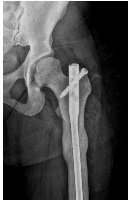
Figure 4. Postoperative 2 nd year anteroposterior of the left femur. The fracture healed without any complication.