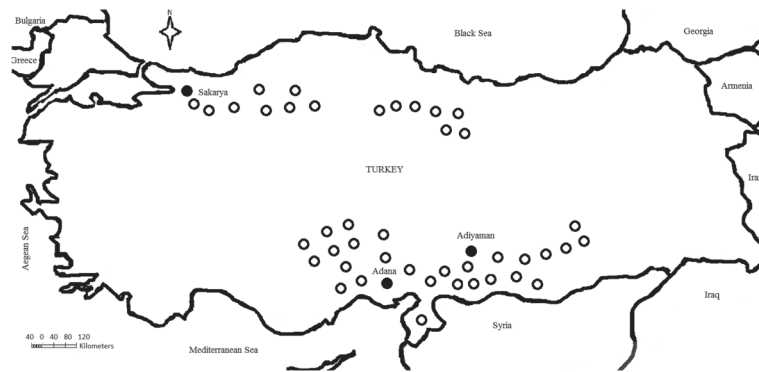
Fig. 1. Bovine ephemeral fever (BEF) outbreaks in Turkey, 2012. ○; BEF-suspected regions and ●; the provinces where the samples were collected for testing.

with diethylpyrocarbonate (DEPC). Reverse transcriptase-polymerase chain reaction (RT-PCR) was performed as described elsewhere [8]. For detection limiting of RT-PCR, 10-fold dilutions from 10^{-6.25} tissue culture infectious dose 50 (TCID 50 ) m^{-1} in VERO cells of the virus isolated from 2008 cases were used and then tested by RT-PCR. To overcome both false positivity and false negativity, we included negative and positive controls in each experiment.