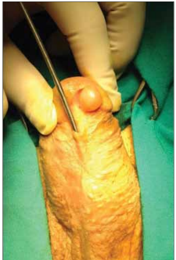
Fig. 3. Examination under anesthesia: Open urethra and parametatal cyst.

Competing interests: The authors declare no competing financial or personal interests.