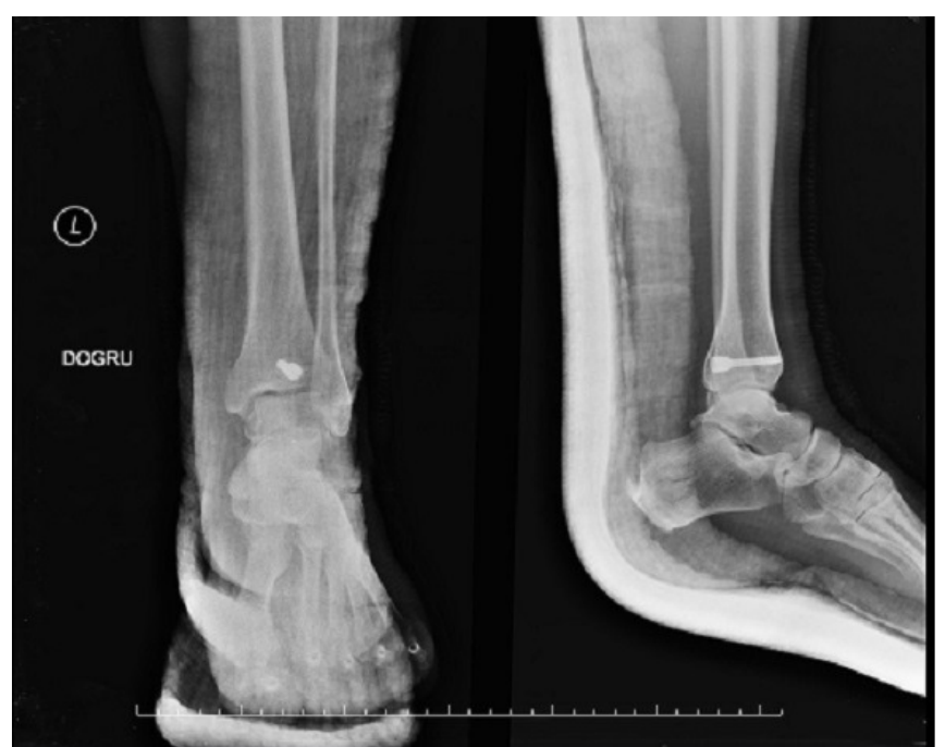
Figure 3: closed reduction and One compression screw was fasted at posteroanterior orientation and the fracture was fixed. Anteroposterior (a) and lateral X-ray of the ankle