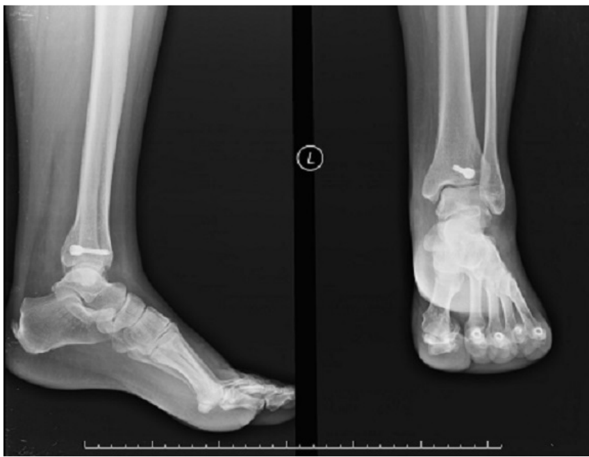
Figure 4: on final radiographies, union was verified