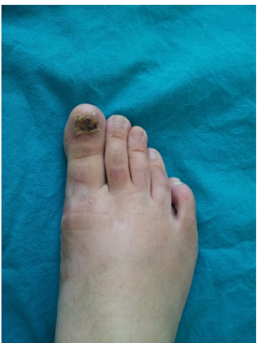
Figure 1. It could be seen the discoloration at the nail surface and nail bed in this picture. Also the tissue destruction is obvious in the nail and nail bed.