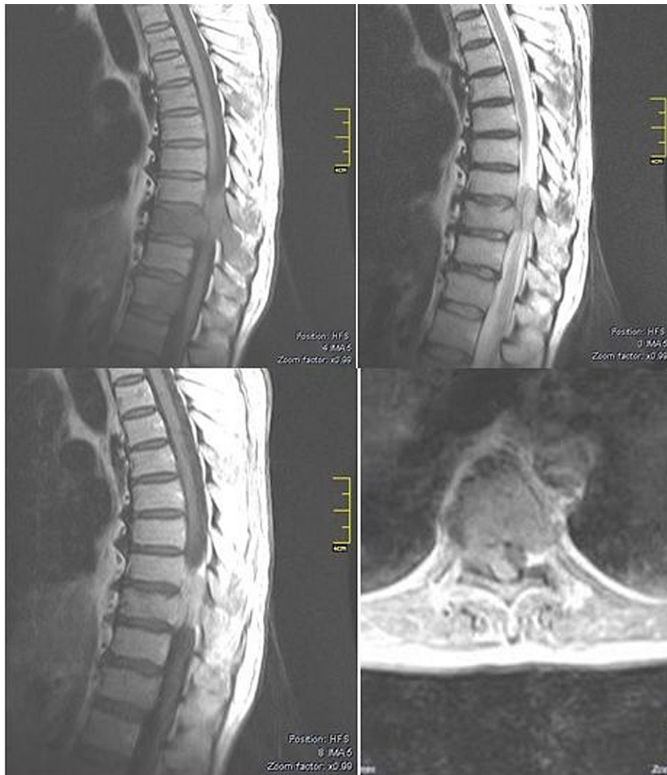
Fig. 1. A. T1 thoracic sagittal MRI shows epidural metastatic ENB in T9–10 level. B. T2 thoracic sagittal MRI shows epidural metastatic ENB in T9–10 level. C. T1 thoracic sagittal contrast-enhanced MRI showing intense homogeneous enhancement of epidural metastatic ENB in T9–10 level, and D. T1 thoracic sagittal contrast-enhanced MRI showing intense homogeneous enhancement of epidural metastatic ENB in the left side the T9–10 level of epidural space.

underwent to the extensive neck dissection surgery. histopathological diagnosis was same.