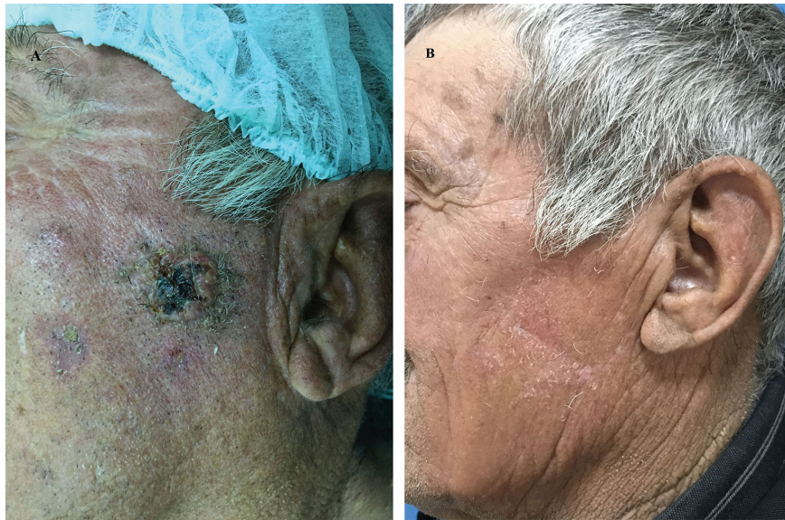
Fig. 3: Eighty-nine years old male patient with cSCC on his left cheek was referred to our clinic. The defect was reconstructed with rhomboid flap. (a) Preoperative, and (b) Postoperative 12 months photos of the patient were presented.