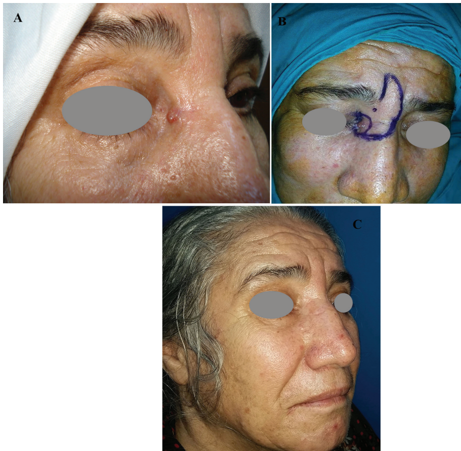
Fig. 1: Sixty-eight years old female patient with BCC on her right medial canthus admitted to our clinic. The defect was reconstructed with procerus flap. (a) Preoperative, (b) Intraoperative, and (c) Postoperative 24 months photos of the patient were presented.

could not find any detailed information about NMSC in our country due to inconsistent data collection. However, BCC/cSCC ratio was 2.1 according to the present study. This result was lower than in the literature that the BCC/cSCC ratio is 3. 10 Moreover, Karadeniz et al. reported the ratio as 1.1 11 and Ülkür et al. found it similar with the literature in their study. 12 Therefore, we think that BCC/cSCC ratio could be different from literature in all around of our country. However, further multicentric studies should be done to evaluate the correct ratios.