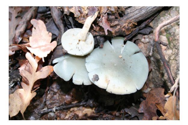
Figure 2. Clitocybe odora.

60 A. Türkoğlu et al. / Hacettepe J. Biol. & Chem., 2011, 39 (1), 57-60