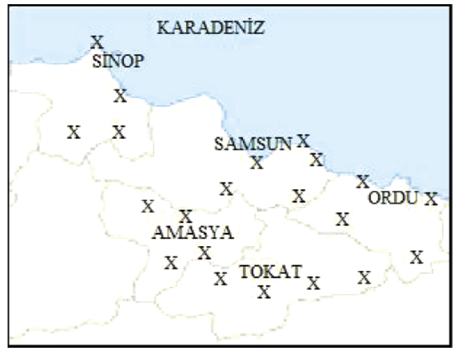
Şekil 1. Serolojik tarama için örnekleme yapıldığı yerler Fig 1. Locations of flocks and herds sampled for serosurvey