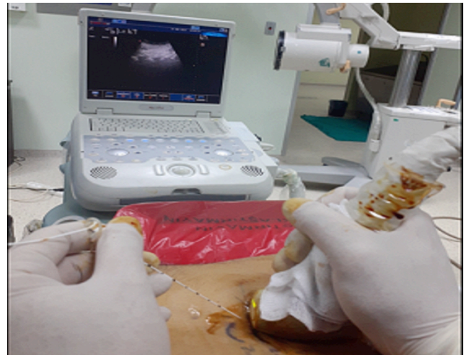
Figure 1 (B): The sagittal plane convex probe and needle orientation.

gesic agent, when needed. No complications were observed, and the patient was discharged on the third postoperative day, with adequate pain control. The patient's low VAS scores and complication-free postoperative period suggested analgesic efficacy of RLB.