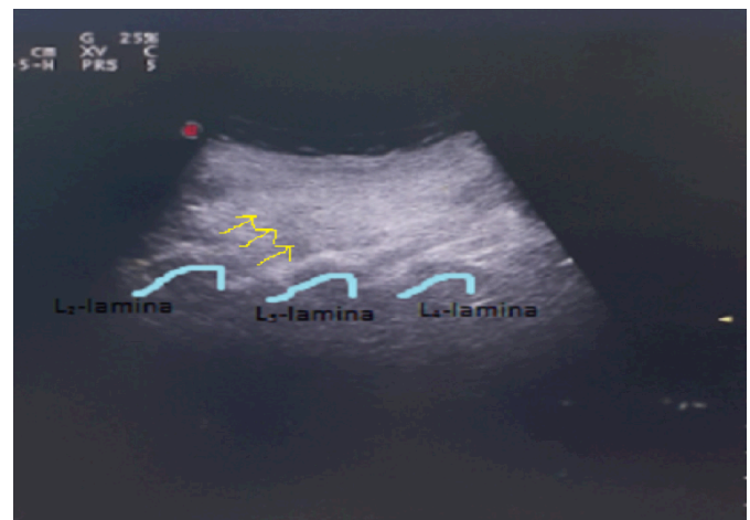
Figure 1 (C): The ultrasonographic visualisation of the needle and the lamina.