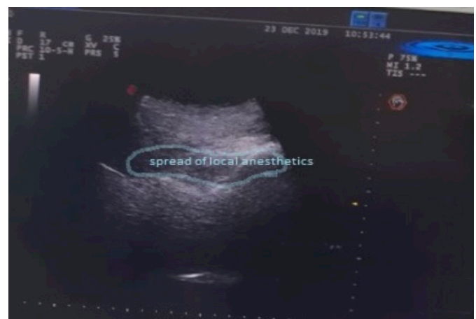
Figure 1 (D): The dispersion of local anesthetic over the lamina.