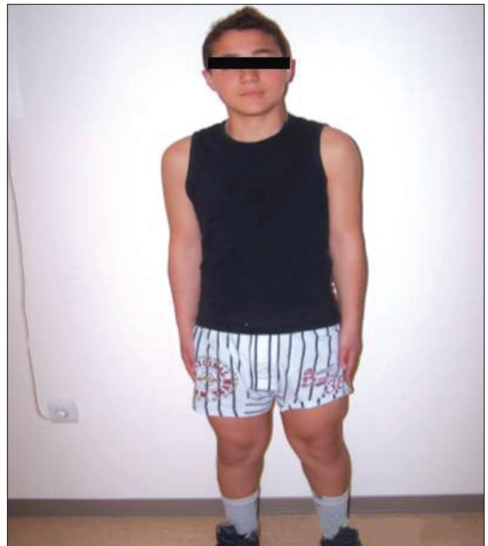
Figure 1: Characteristics of the case.

The patient was diagnosed as OI type IV and oral vitamin D and calcium was initiated, followed a month later with oral alendronate treatment (10 mg/day).