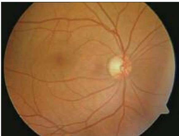
FIGURE 1: Fundus of right eye showing a normal optic disc

A 43-year-old man admitted to our clinic with a sudden loss of vision in the right eye. He had been on IFN- \alpha treatment for chronic hepatitis B which was interrupted 9 months earlier due to systemic side effects. He had been administered 9 million units subcutaneous IFN- \alpha three day a week for one year. He had no history of ocular or any other systemic disease. Best corrected visual acuity in the right eye was counting fingers from one meter and it was 10/10 in the left eye. There was no afferent pupillary defect. Fundus examination revealed bilateral normal optic discs (Figure 1). Both pattern and flash visual evoked potential (VEP) recordings were performed. Pattern VEP waveform in the right eye was distorted and flash VEP was delayed with lower amplitude with respect to the left eye (Figure 2). There were no pathological findings in neurological and serological tests. MRI of the brain and orbits was normal. Seven days later, his visual acuity was measured as 5/10. However, color vision tested with Ishihara plates was significantly reduced. One month after, his visual acuity was found to be 8/10 and color vision 13/24 without any treatment. Six months later, the patient was admitted to hospital suffering from decreased vision (1/10) in the same eye. Fundus examination was normal but brain MRI demonstrated several white