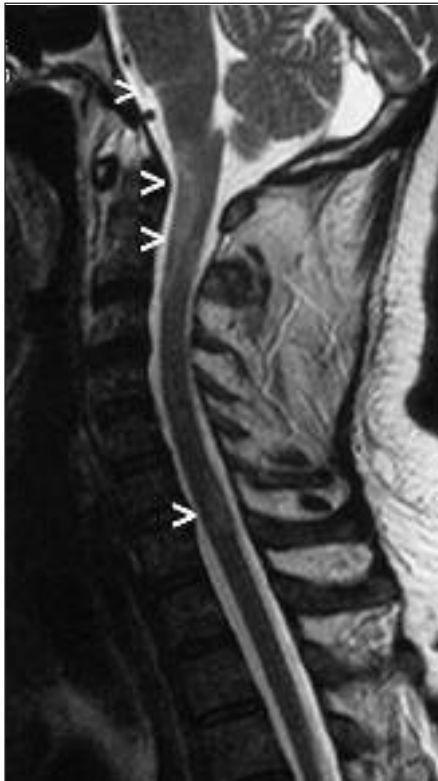
FIGURE 4: Pathologic signal enhancement in T2W spinal MRI at the level of brain stem, C1-3 and C6-7, indicating a demyelinating disease.

pathy. 3,4,6,7 IFN is a leukocyte-derived cytokine that is a part of the chronic hepatitis virus infection therapy. IFN has multiple effects on the immune system and is known to trigger the development of autoantibodies, as well as the onset or exacerbation